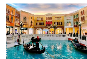
The Venetian Macao