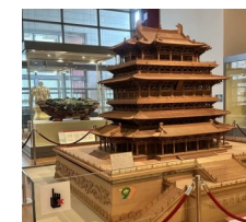
Handover Gifts Macao Museum